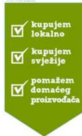
b) Textual PoS Material