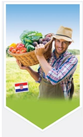
a) Pictorial PoS Image